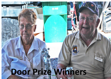
Door Prize Winners